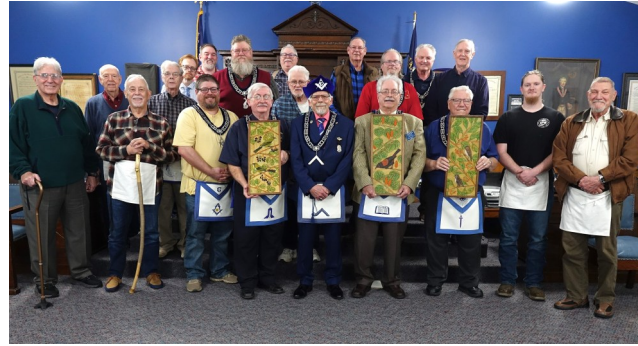
NC #91 members displaying their 175th Anniversary gift from Haeata #272 of Hastings, New Zealand.