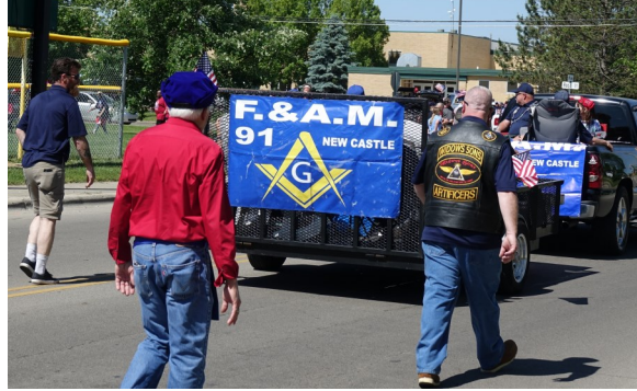
New Castle Memorial Day Parade 2023